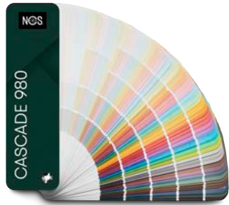
Arranged by Hue