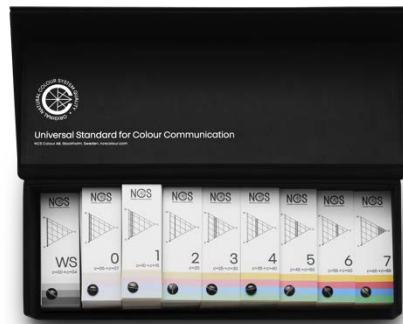
Arranged by nuance